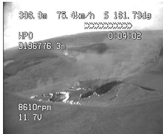
Fig.3. Reconnaissance by UAV

the display of the laptop computer from the camera (thermal camera) that it carries. The accurate visual information received on the parameters of the fire (dynamic element) can be transformed onto the digital map as quickly as possible. If we now connect the hottest spots with a mathematical algorithm, objective information about the fire's exact line can be determined. Thus the fire-fighting leader can obtain information about a given fire that can satisfy the demands of effective fire-fighting, within a minimal amount of time.