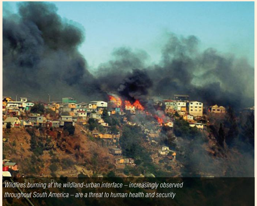
Wildfires burning at the wildland-urban interface – increasingly observed throughout South America – are a threat to human health and security