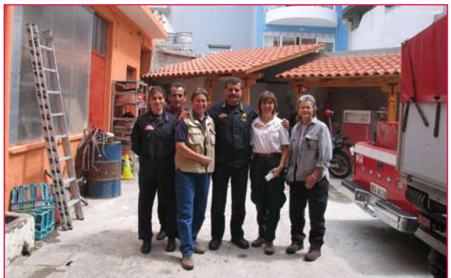
The U.S. team visits the Chalkida Fire Station.