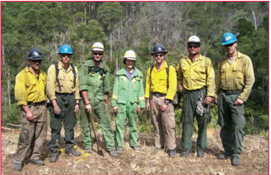
Region 2 Hotshot firefighters (comprised of members from several U.S. Interagency hotshot crews) with their Australian supervisor counterparts at Tom Groggin Station staging area.