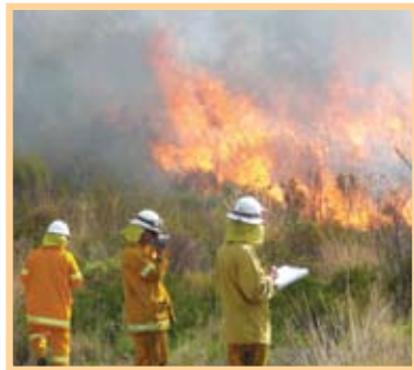
On the Cover: An Australian Bushfire Cooperative Research Center research burn conducted at the Ngarkat Conservation Park, South Australia, March 2008.

The USDA Forest Service's Fire and Aviation Management Staff has adopted a logo reflecting three central principles of wildland fire management: