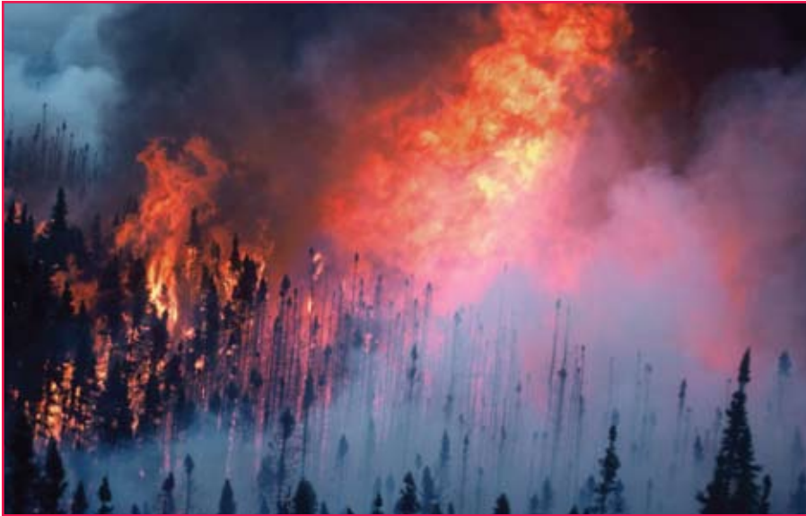
Major run of the Coffee Fire, Saskatchewan.