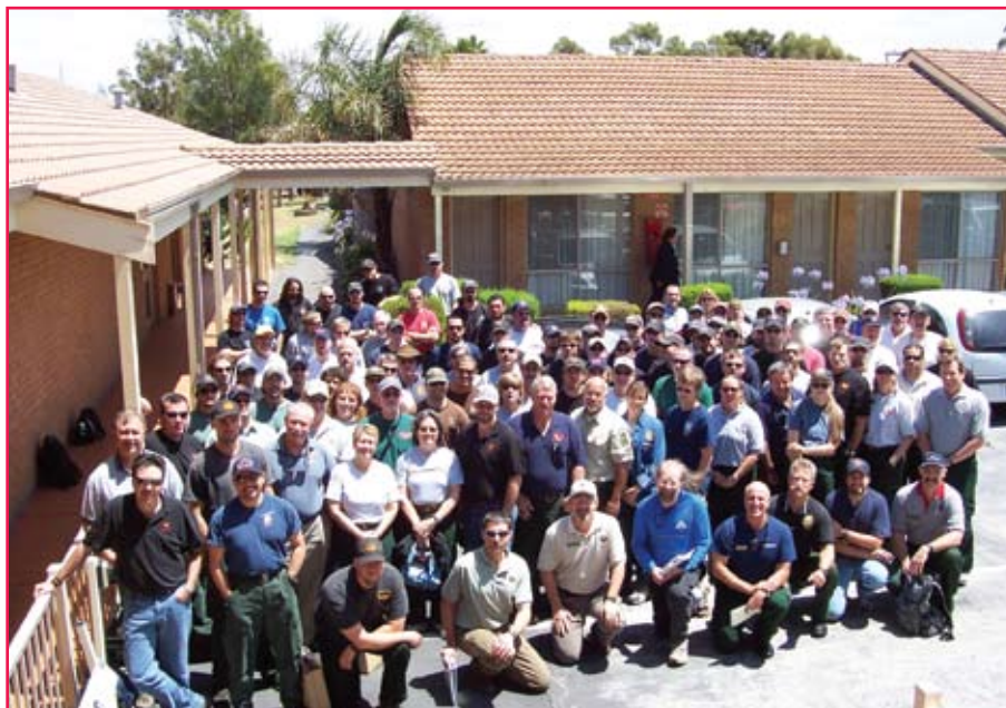
U.S. firefighters line up for a photo op after completing their 2-day in country orientation in Melbourne, Victoria.

“Volunteers are the backbone of the Victorian wildfire suppression organization.”