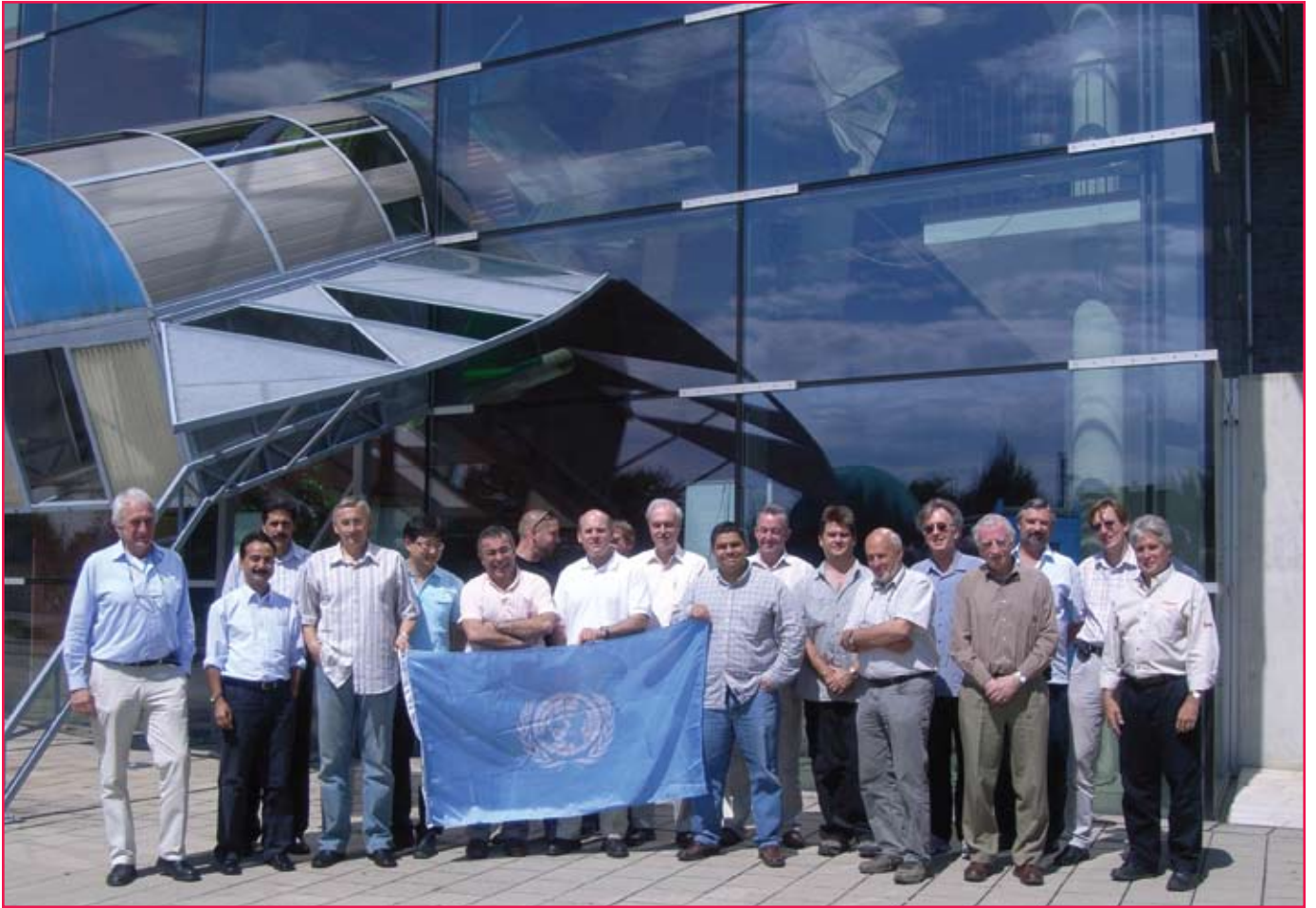
The most recent consultation of the UNISDR Wildland Fire Advisory Group was held at the Global Fire Monitoring Center (GFMC) in July 2008 with representatives from the regions of the Global Wildland Fire Network (Australia, Austria, Canada, Chile, Costa Rica, Cuba, Macedonia, Nepal, South Africa, United States of America) and the United Nations and International Organizations (Food and Agriculture Organization, Global Fire Monitoring Center, International Association of Fire and Rescue Services, International Tropical Timber Organization, UN International Strategy for Disaster Reduction).

In response to this recommendation and the need for implementing the strategic goals of the UN Convention to Combat Desertification, Convention on Biological Diversity, the UN Framework Convention on Climate Change, and the Ramsar Convention on Wetlands, the Global Fire Monitoring Center (GFMC) was founded in 1998, aimed at providing a global fire monitoring system and an interface between the fire science community, fire managers, and policymakers.