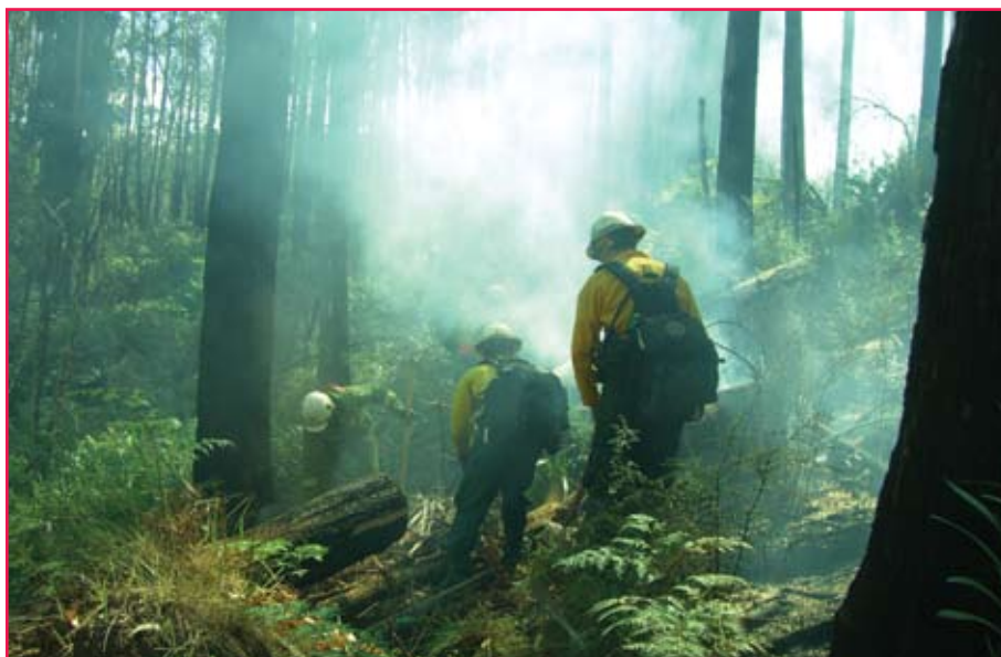
Region 2 Hotshot firefighters (comprised of members from several U.S. Interagency hotshot crews) mop up remaining hot spots on the 5,100-acre, lightning-caused, Hermit Mountain Fire in the Alpine National Park, Victoria, Australia.