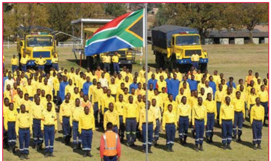
Passing out parade of Working on Fire wildfire fighters in Ermelo, South Africa. Photo by Bruce Sutherland, 2008

Apart from the ground crews, WoF comprises several other compo-