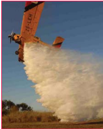
A Working on Fire bomber in action during training in Nelspruit, South Africa.

“In all, WoF employs just over 1,400 people nationally,” says Heine. Of these, it is the 1,056 firefighters who make up the most visible face of the organization, instantly identifiable at the scene of any major wildfire in their bright yellow uniforms. For many of the recruits, joining WoF has drastically changed their lives.