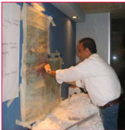
Mapping risks, hazards, and values in the Athens area.

As part of the longer term capacity-building effort, the Forest Service and the Government of Greece have initiated a 2-year cooperative program to address emergency and wildfire management needs in Greece. The Forest Service is collaborating with several Ministries in Greece, including the Hellenic Ministry of Interior; the Hellenic Ministry for the Environment, Physical Planning, and Public Works; and the Hellenic Ministry of Rural Development & Food, to sup-