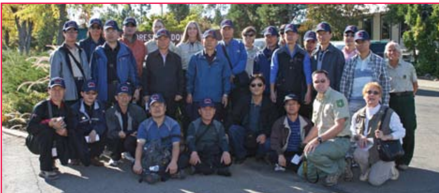
A group of 21 Korean forest fire officers and assistant directors pose in front of the forest supervisor's office in Placerville, CA, with Forest Service employees.