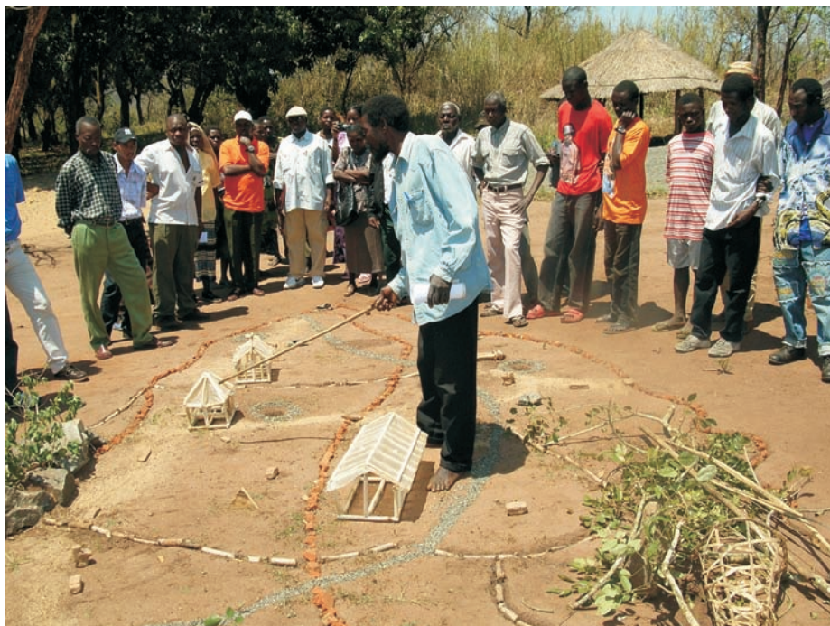
Figure 2. Knowledge transfer and capacity building in fire management involving local communities (Community-Based Fire Management) ensure the transfer of state-of-the-art science to local application, e.g. for sustainable land-use planning and carbon management. The photograph shows a meeting of a local community in Mozambique preparing a fire management plan for the community, sponsored by the UNEP/GEF project “Integrating Vulnerability and Adaptation to Climate Change into Sustainable Development Policy Planning and Implementation in Southern and Eastern Africa”.

of climate extremes, environmental pollution, ecosystem manipulation, and fire effects are drivers of vegetation degradation throughout the world. An increase of vulnerability of human populations to fire and to secondary effects of fire is also obvious. Although this trend is revealed by a wealth of scientific knowledge, the gaps in fire management capabilities from local to global levels are evident. Thus, the current situation and the expected trends are challenging the international community to address the problem collectively and collaboratively.