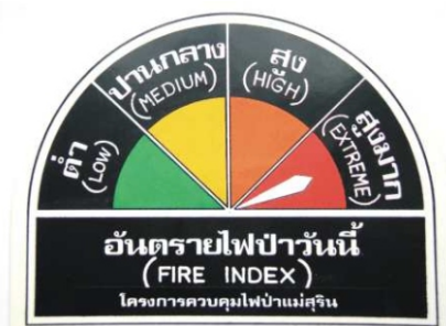
Fire Index sign used in Thailand to inform local populations on the daily fire danger.