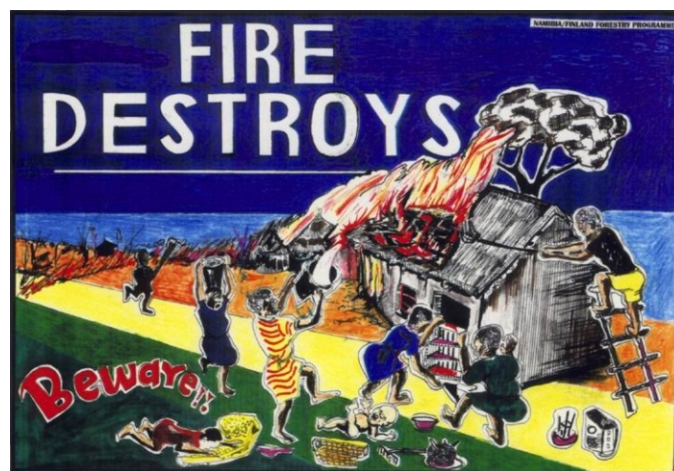
Both public awareness-raising posters from Africa were developed by local artists in Namibia, in the frame of the Namibia-Finland Forestry Programme.

For more information on early warning systems for wildland fire see GFMC at: http://www.fire.uni-freiburg.de/fwf/fwf.htm