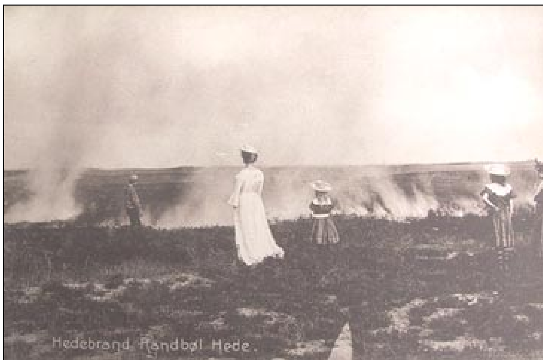
Figure 2. Prescribed burning for regeneration of Calluna heather, Randbøl Hede (Denmark), around 1900.