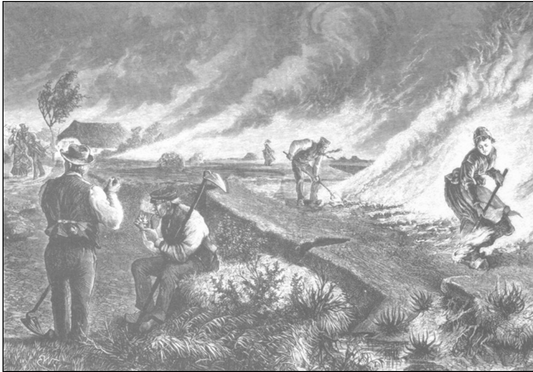
Figure 1. Superficial peatland burning for cultivation in Frisia (Northwest Germany) around 1900.

form of fuel for machinery, fertilisers, herbicides and pesticides. Agricultural, forestry and hunting research has historically tended to avoid fire research as a subject area as it is often associated with damaging wildfires. Fire science, fire ecology and prescribed burning are therefore relatively new terms for land managers in Europe although the underlying concepts have been applied in a traditional way in some cases for thousands of years.