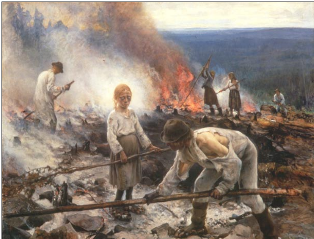
Figure 3. Slash-and-burn agriculture in Finland in the second half of the 19 th Century. Painting by Eero Järnefelt (1873): "Raatajat rahanalaiset". Exhibition of painting: Ateneum, Helsinki,

Traditional burning practises that are used to support hunting (grouse moor management), most evident in the United Kingdom, are also gradually changing. Empirically based fire modelling research is also being conducted in a number of countries, including the United Kingdom and Germany. Traditionally burning was often a shared activity between neighbours or it drew on other resources within land management units. There are fewer people with appropriate fire knowledge in rural areas to share the task now. The people left are generally older and less prepared to take the risks of wildfires occurring due to escapes. Insurance is becoming more expensive to obtain and so the use of fire is being constrained in many areas due to the significant resource requirements and financial costs. There is a need to increase the productivity of practitioners by implementing training initiatives and developing a professional prescribed burning skill base. Technical developments and research are also expanding the window of opportunity for burning and helping fire suppression efforts (Murgatroid 2002).