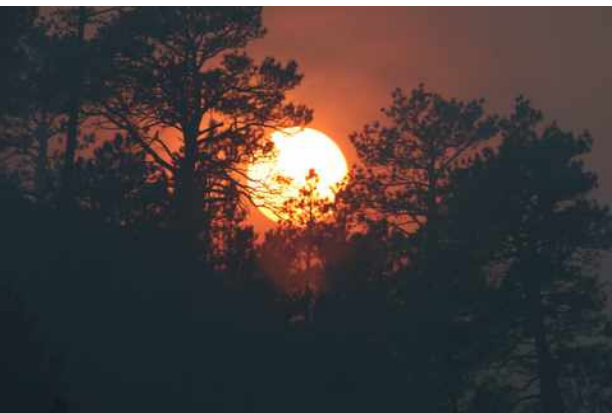
A smoky sun on the Rankin Ridge Prescribed Fire, Wind Cave National Park, Oct. 25, 2005

cooperator is the Los Angeles County Fire Department. (more details on page 2)